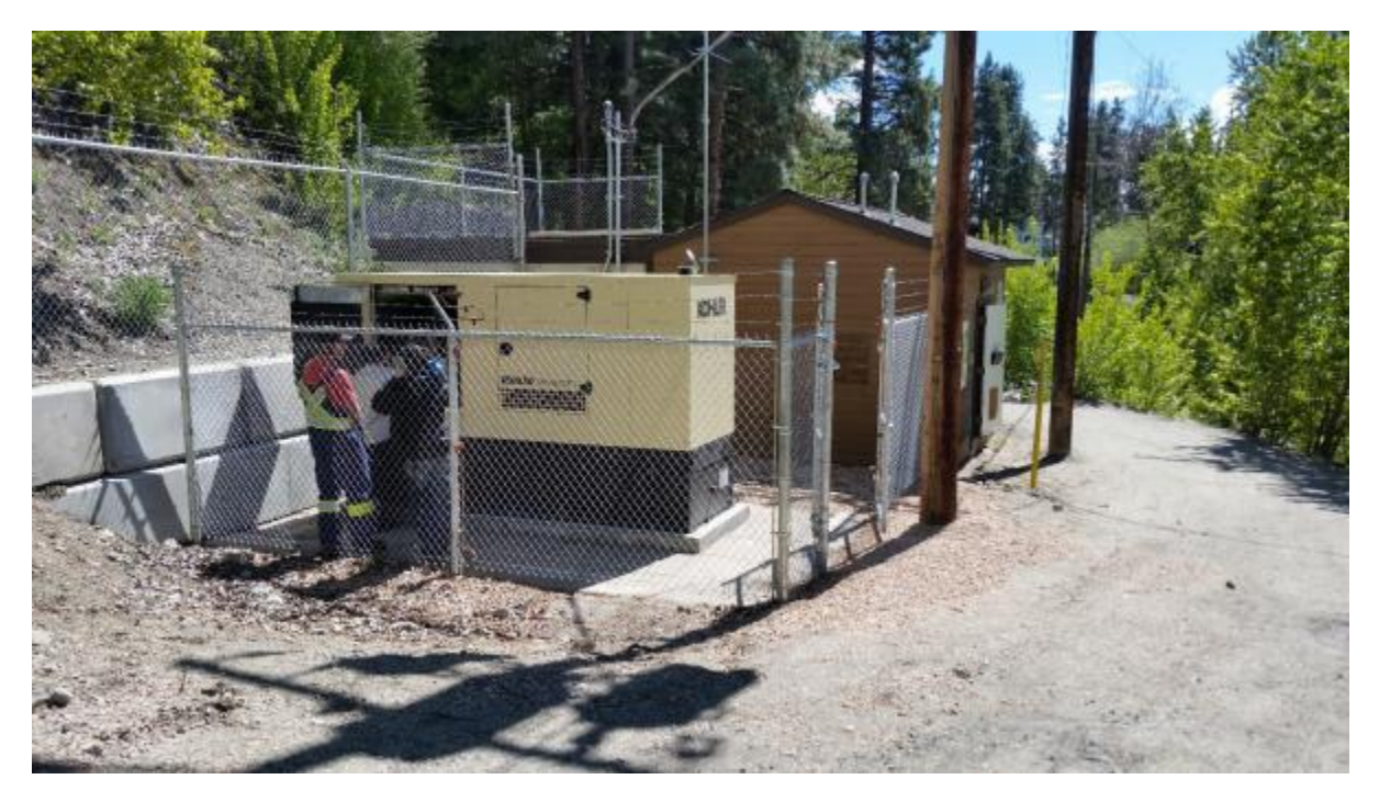
Figure 3 McKay WTP Generator