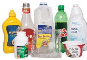
Hard Plastic Bottles, Tubs and Lids