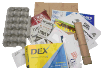
Paper & Cardboard