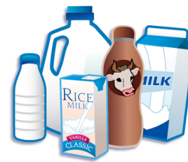
Paper Cartons, Tetrapaks