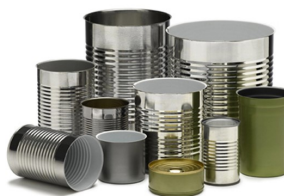
Cans and Aluminum Foil