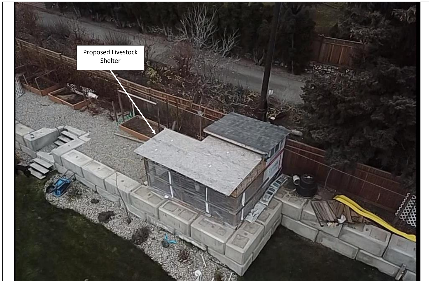
Attachment No. 2 – Site Photo