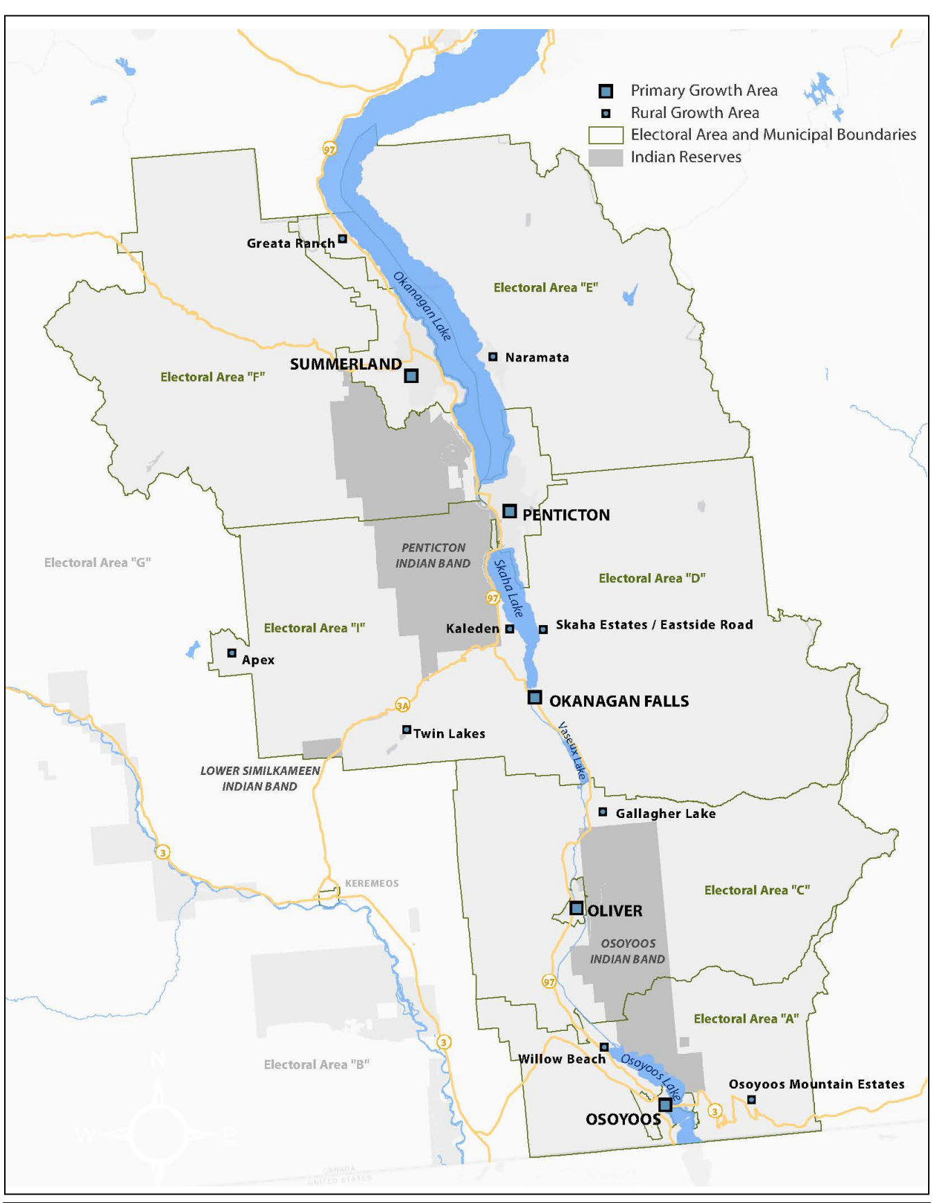
Attachment No. 1 – Designated RGS Primary & Rural Growth Areas (RGS Bylaw No. 2770)