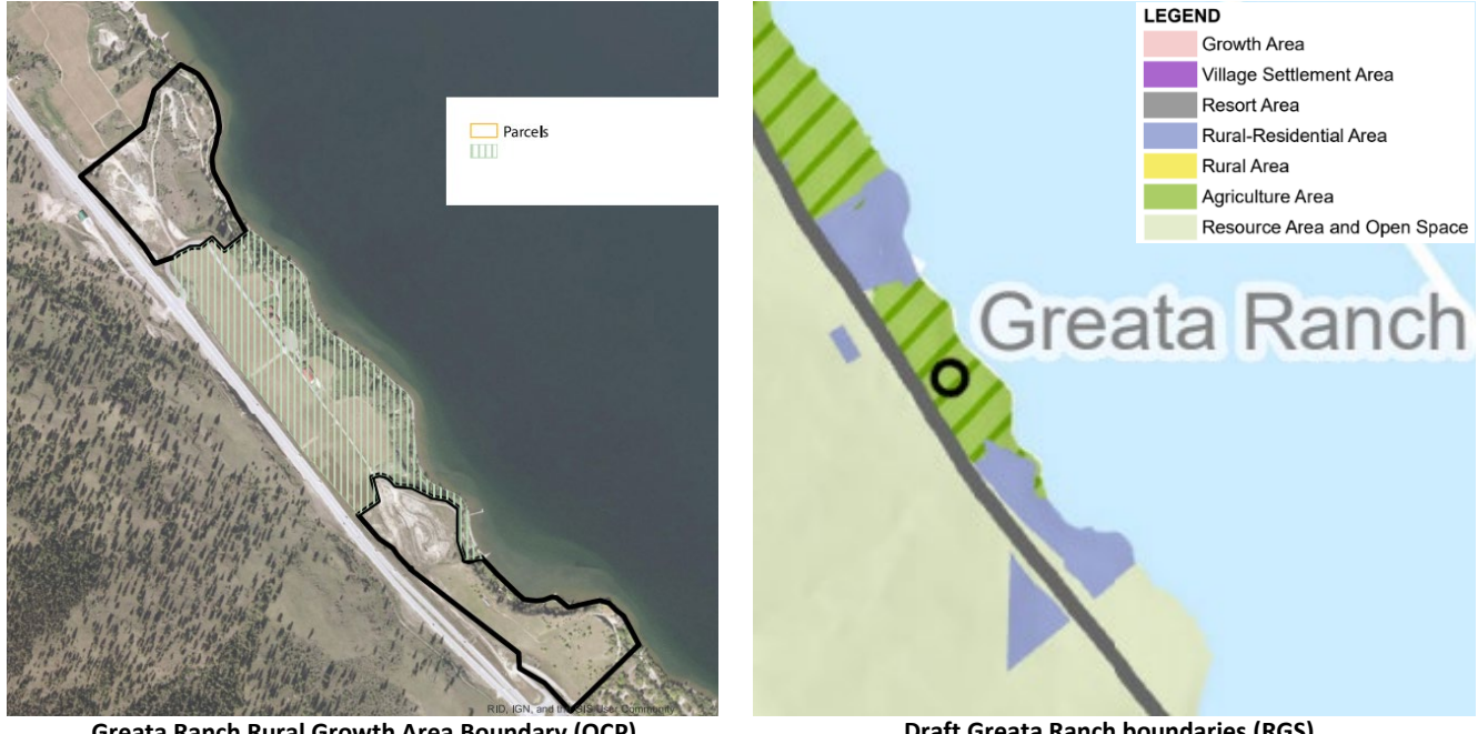
Greata Ranch Rural Growth Area Boundary (OCP)

For these reasons, when the OCP was last reviewed in 2018, an outcome was a policy indicating that the suitability of Greata Ranch as a "Rural Growth Area" should be reviewed when the RGS is reviewed or updated.