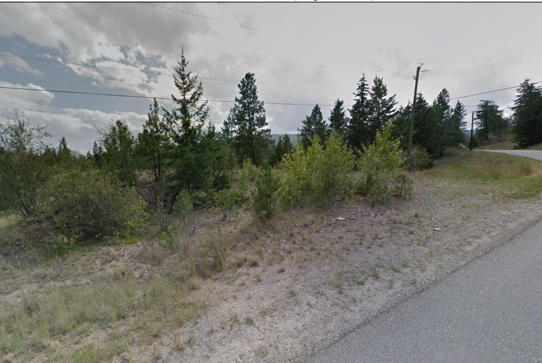
Attachment No. 2– Site Photo