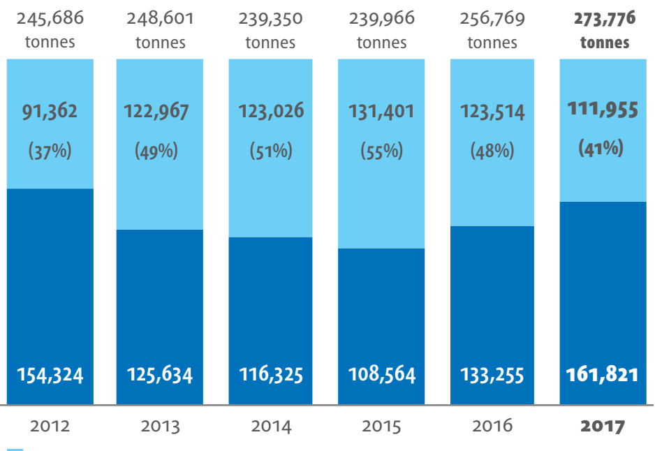
Emission Reductions Claimed toward CN Status