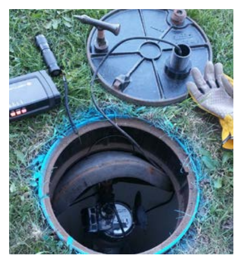
RDOS West Bench Homeowner Leak Detection Program

Approximately 55% of CARIP respondents have organics collection programs in place (an increase of 2% since 2016). Over 80% of medium-sized and large communities operate such programs (an increase of 10% from 2016).