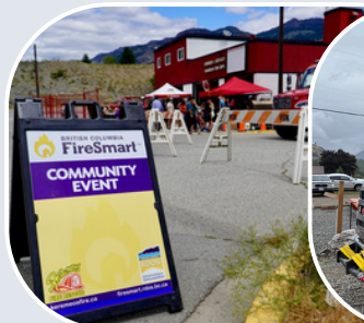
Keremeos Fire Department Open House