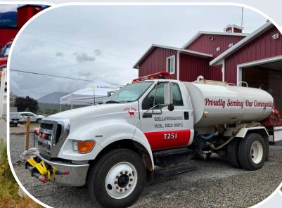
Willowbrook Volunteer Fire Department Open House