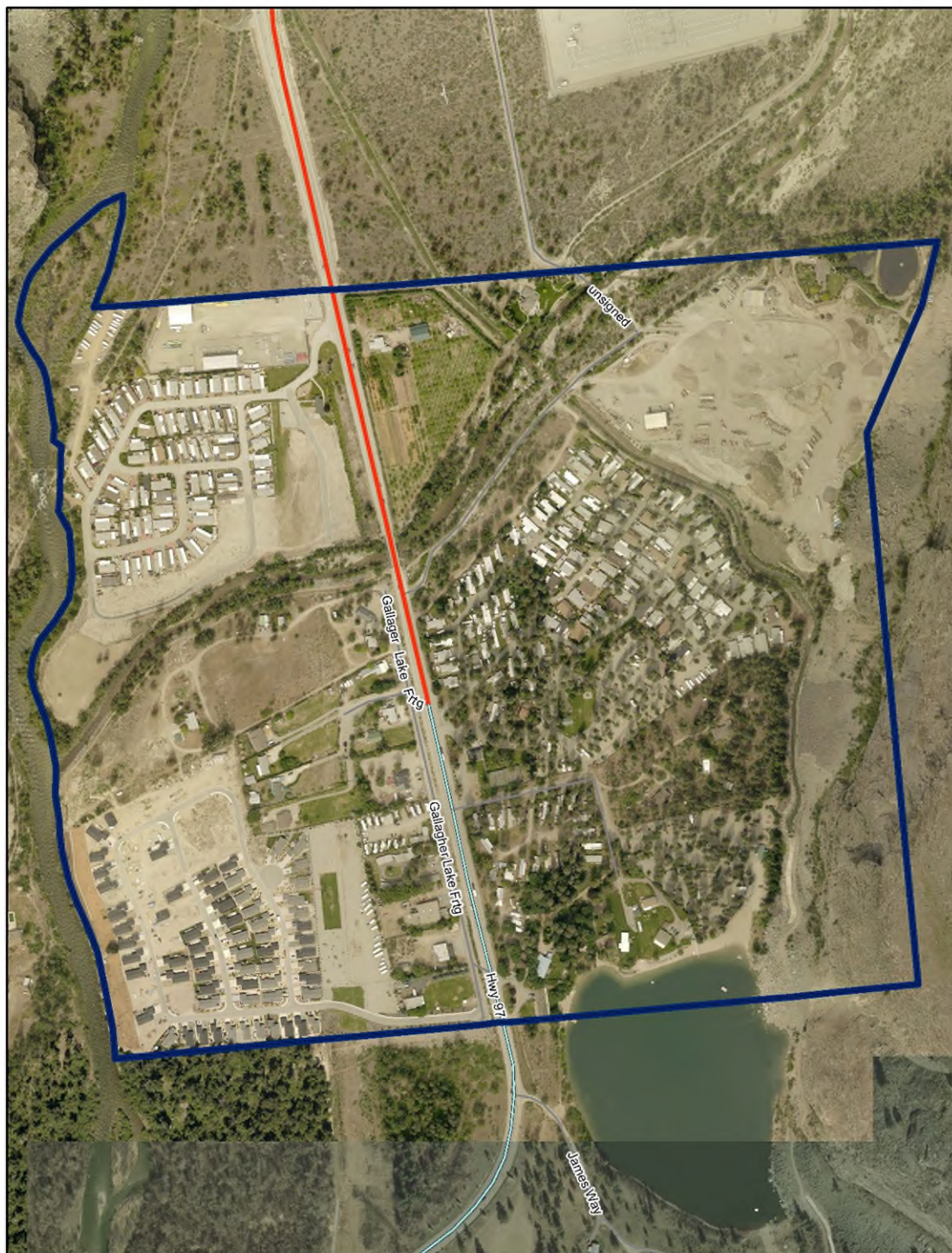
Figure 6.3: Gallagher Lake Rural Growth Area Containment Boundary

of Gallagher Lake has been about 2% per year. At the same rate of growth there is over 30 years of development capacity in Gallagher Lake. Nevertheless, a more rapid rate of growth is anticipated in coming years with the introduction of urban services and new employment opportunities in the area.