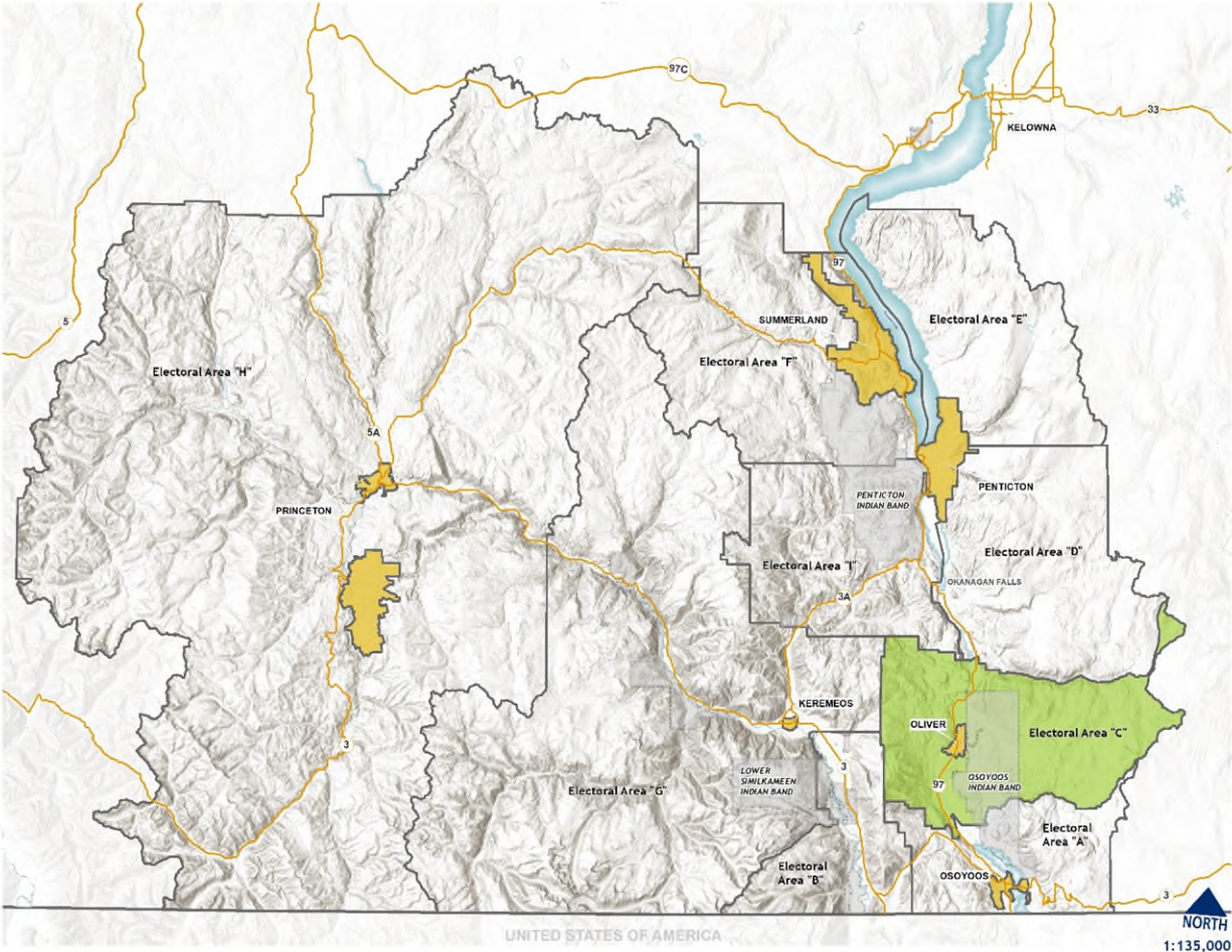
Map 1 – Context Map