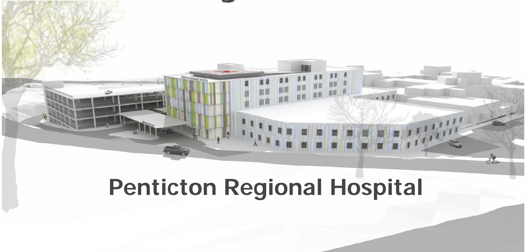
Penticton Regional Hospital