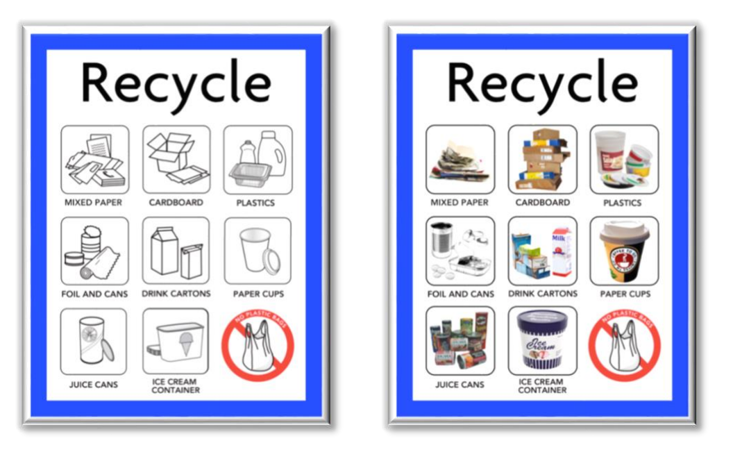
Click image to return to website and download