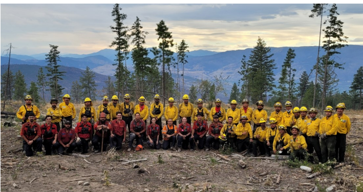
Mexican Firefighters, who have been integral to meeting project objectives, with BC Wildfire Service's Lytton Rattlers Unit Crew

In the interest of public and responder safety, an Area Restriction was implemented on July 24 and expanded on Aug 7. More information is available at: www.bcwildfire.bc.ca .