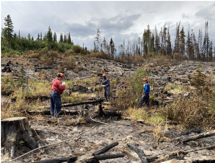
Safety check-in with mop-up contact crew on Brenda Ck. Fire