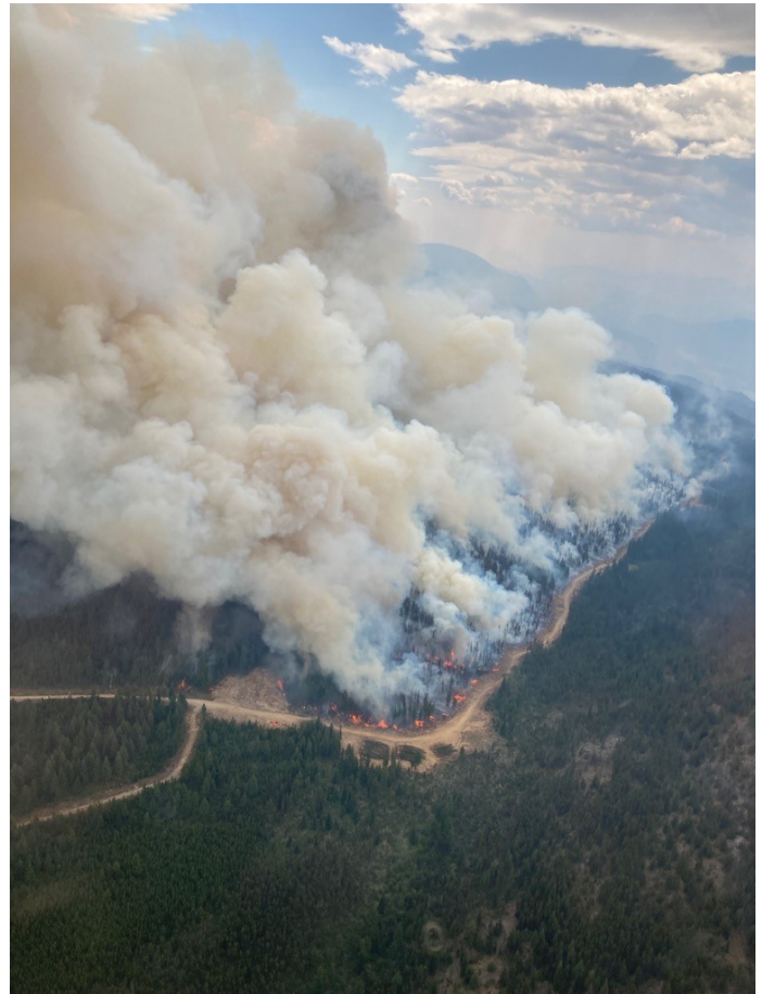
Successfully executed planned ignition on Thomas Creek fire

A highly trained Mexican firefighter observing fire behaviour on the Nk'Mip Creek fire from a safe distance.