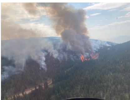
During planned ignition August 6

A BC Wildfire Service Incident Management Team is managing the Okanagan Complex. Aircraft and other resources may be reallocated from day to day within the complex as priorities shift.