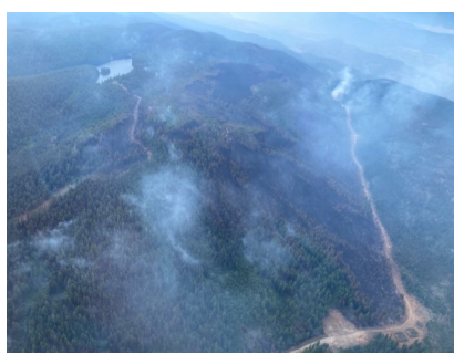
After planned ignition August 7