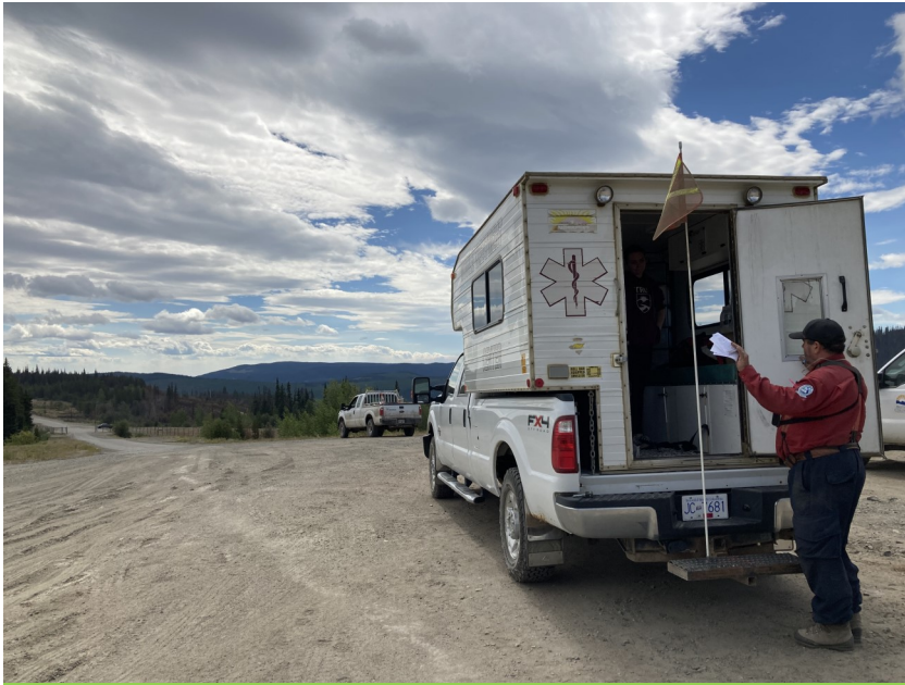
Safety Inspection of Emergency Transport Vehicle on Brenda Mine fire