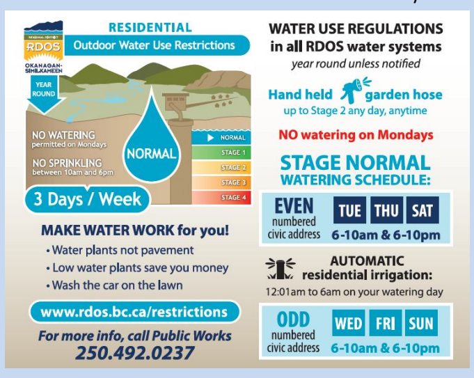
The 2" x 3" plastic reminder is for the most used outdoor faucet, where the hose attaches – known as a hose-bib. The envelope will contain a zap-strap to help secure it to the shaft of the faucet.

The 4" x 6" magnet can be placed on a fridge or any metal surface like a filing cabinet or even some exterior doors. Place the magnet where it will cue occupants to adhere to sprinkling regulations and if applicable, to insure automatic timers are set correctly.