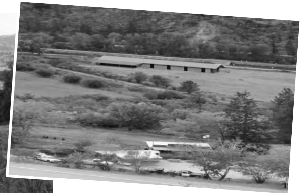
Architectural renderings showing possible views of the new treatment plant from the east and west.