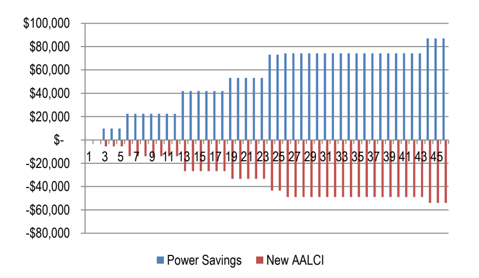
Figure 2 Annual Costs and Savings over the 45 Year Twining Initiative

Illustrating the costs and savings over time provides the long-term view of the investment. Seeing the investment in its full term creates the full story behind the one number return, from net-present value analysis. For clarity, the annual costs and savings are illustrated on the first graph, and the capital costs are illustrated on the second graph.