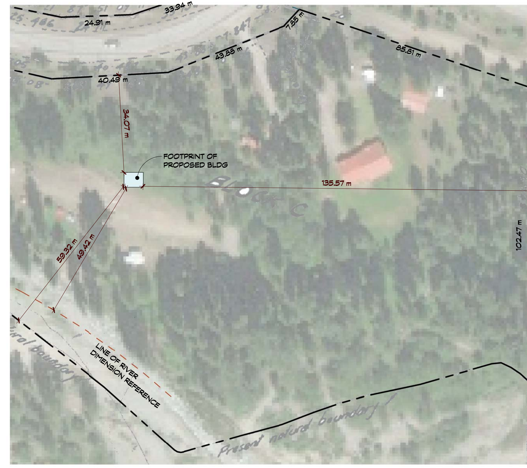
SITE PLAN BLOCK C 1:800