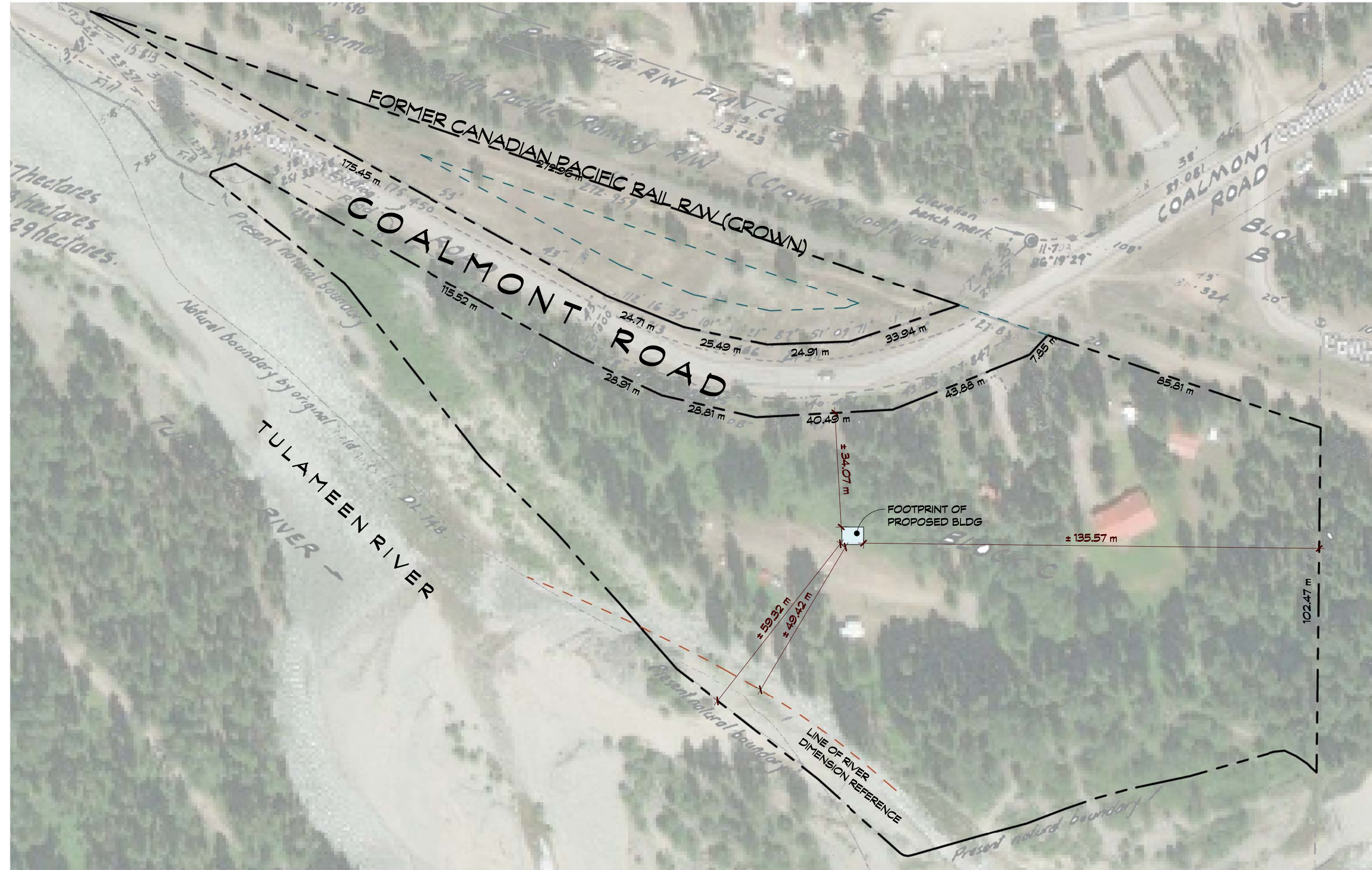
SITE PLAN 1:1000