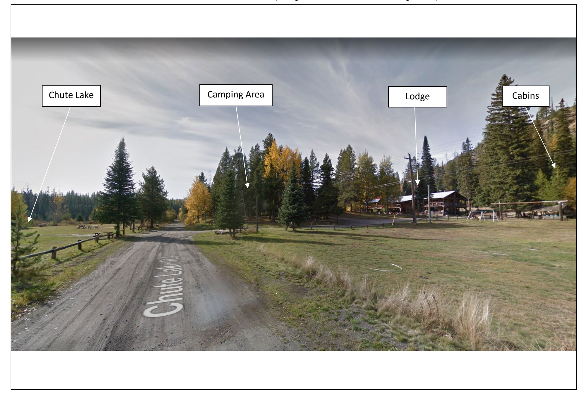
Attachment No. 3 – Site Photo (Google Street View 2014 looking south)