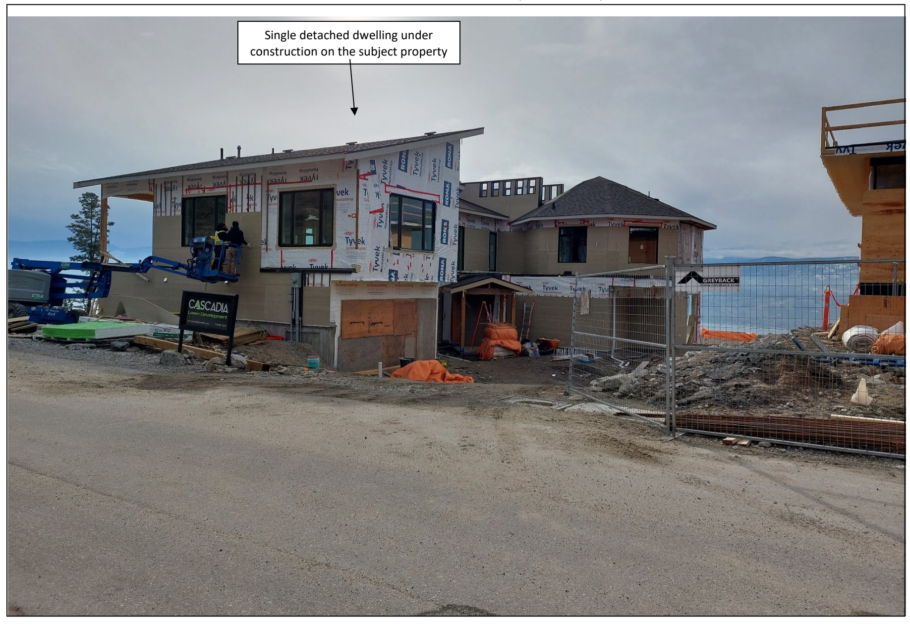
Attachment No. 1 – Site Photo 1 (March 2022)