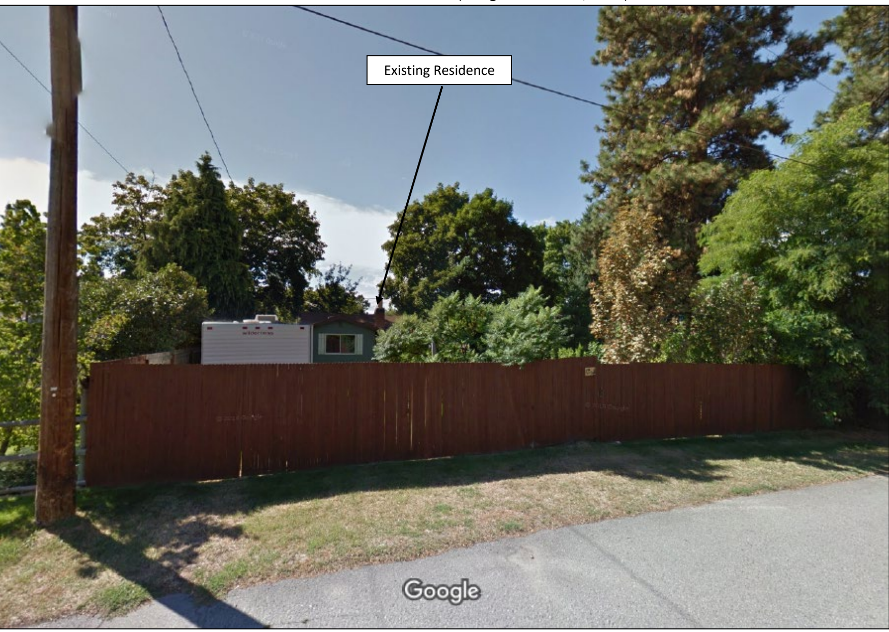
Attachment No. 1 – Site Photo (Google Streetview; 2012)