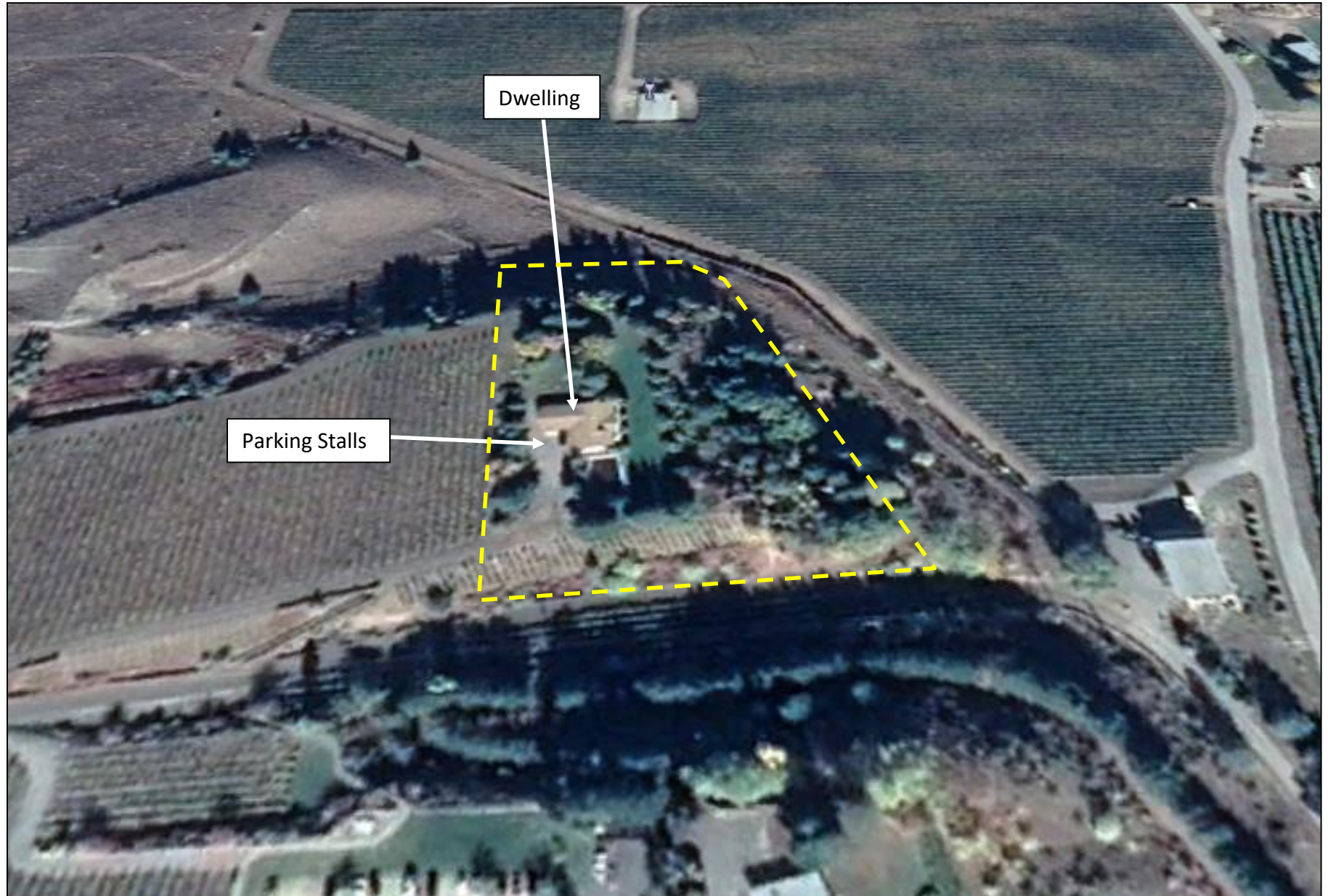
Attachment No. 2 – Site Photo