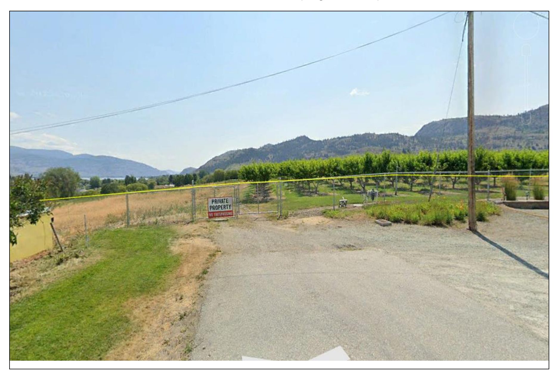
Attachment No. 3 – Site Photo