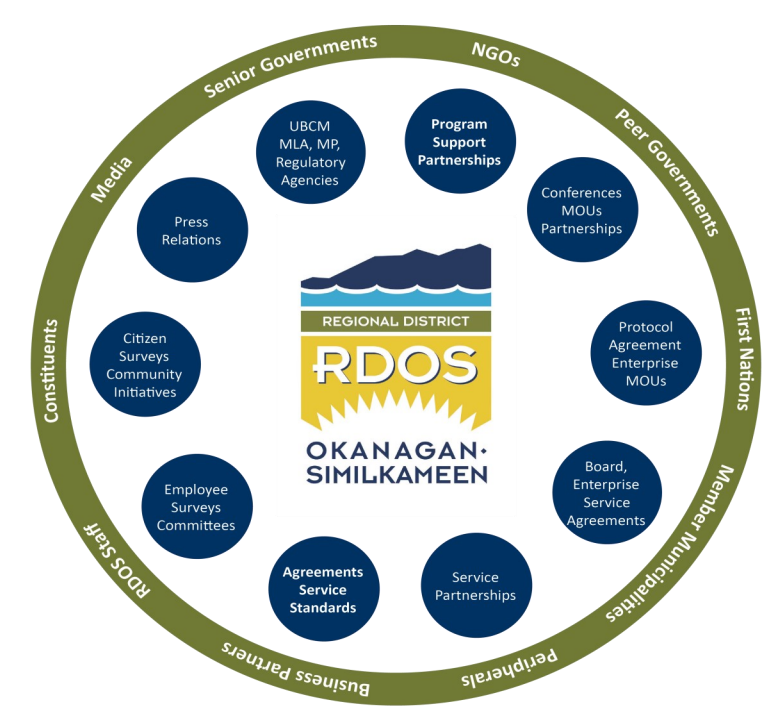
RDOS — Engagement Opportunities

This is also a good time to list other factors that might impact or be impacted by the project, such as the environment, transportation, or other projects within the RDOS or member municipalities.