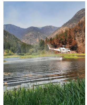
K50863—August 7, Helicopter collecting water with arm.

Drone-operated thermal scanning was carried out overnight to assist crews in eliminating hotspots along the Highway 3A corridor. These activities are helping facilitate the return of evacuees and the reopening of this travel corridor. We are working with MOTI (Ministry of Transportation and Infrastructure) to mitigate fire impacts and risks prior to re-opening roads. The BCWS Structure Protection Branch continues to protect properties in all areas of concern at the fire's edge. Night operations continue with both wildland and structural crews patrolling and mopping up as needed.