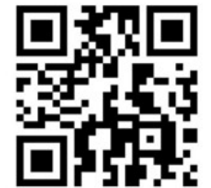
Link to Latest Updates