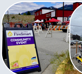
Keremeos Fire Department Open House