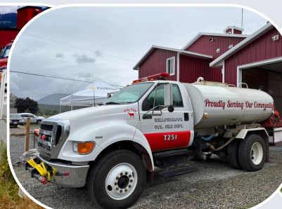
Willowbrook Volunteer Fire Department Open House