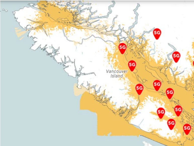
Rogers Coverage Map on Vancouver Island