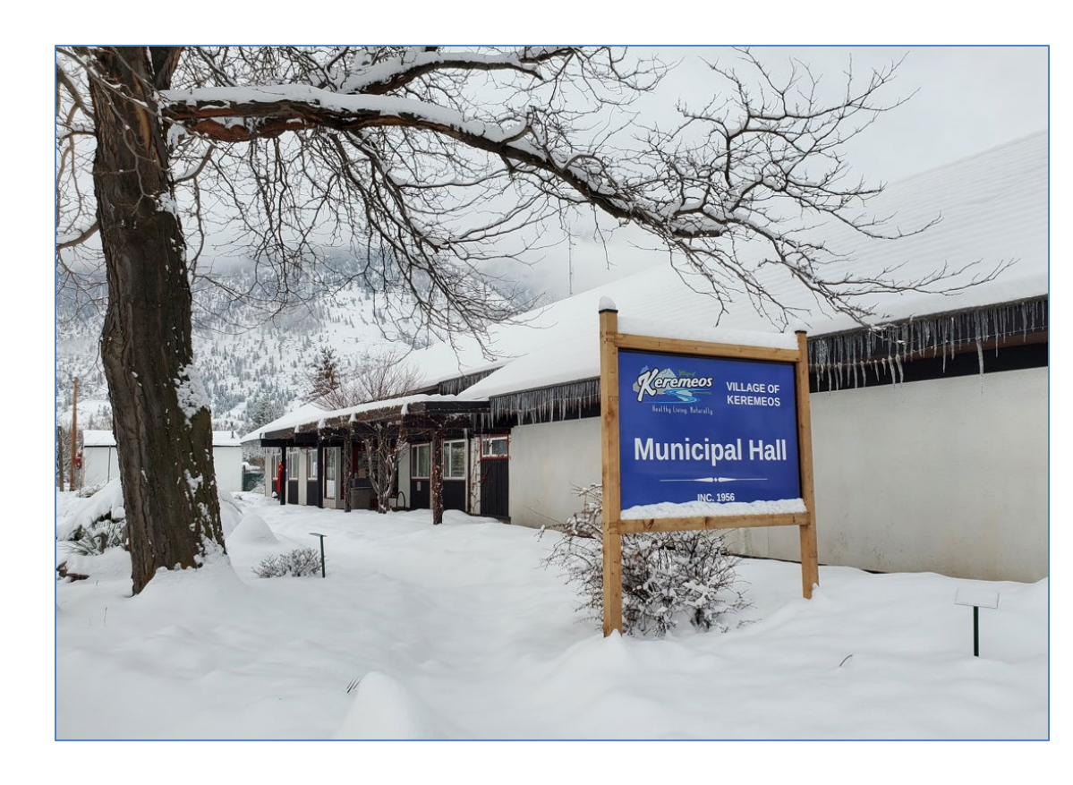
Festive icicles form a backdrop to the new Municipal Hall sign

The project is 100% funded with $3,949,000 in grant monies obtained in 2018. Works related to flood-proofing the plant will be undertaken simultaneously, funded by a further grant of $688,000 obtained in 2021.