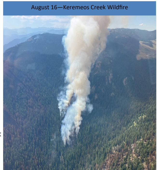
August 16—Keremeos Creek Wildfire

Nearby communities can still expect to see smoke within the fire's perimeter over the coming weeks. This is common with large wildfires, and smoke will continue to be visible until there is significant rainfall at the site. Smoke appearing from well within the fire perimeter and burned material is common. However, smoke that rises from green, unburned fuel or from outside of fire's perimeter should be reported. To report a wildfire or open burning violation, call 1 800 663-5555 toll-free or *5555 on a cellphone.