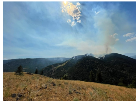
August 16—Keremeos Creek Wildfire

Communities near the northwest and southwest corners of Keremeos Creek wildfire can expect to see increased smoke today, August. 17. Cooler temperatures and increased humidity over the weekend decreased fire activity but fire behaviour is expected to increase as the current warming and drying trend continues. Crews continue to make progress on containment lines and most sections of the fire remain stable. The wildfire’s western flank is most active and currently burning in steep, difficult terrain. The forecast predicts a continuing warming trend for the next couple of days, and lower relative humidity expected with moderate overnight recoveries.