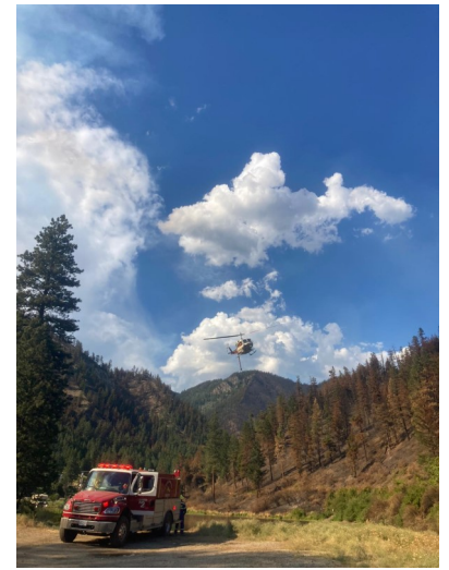
K50863—August 13 Ford Lake