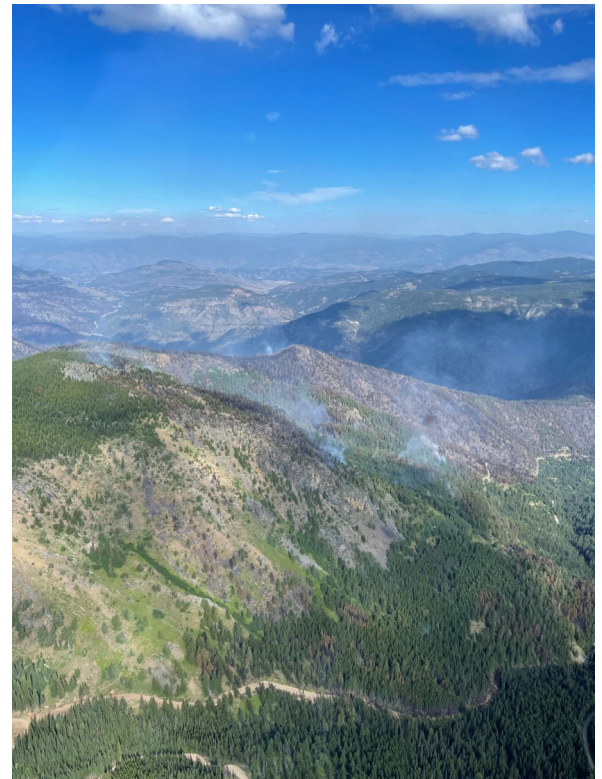
August 14—Keremeos Creek Wildfire

Trees that have been damaged by fire might be unstable and could fall. Ash pits can be hard to detect and can remain hot long after the flames have died down. Nearby communities can still expect to see smoke within the fire's perimeter over the coming weeks. This is common with large wildfires, and smoke will continue to be visible until there is significant rainfall at the site. Smoke appearing from well within the fire perimeter and burned material is common. However, smoke that rises from green, unburned fuel or from outside of fire's perimeter should be reported. To report a wildfire or open burning violation, call 1 800 663-5555 toll-free or *5555 on a cellphone.