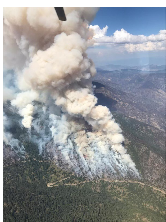
August 11—Planned ignition on the Keremeos Creek wildfire.