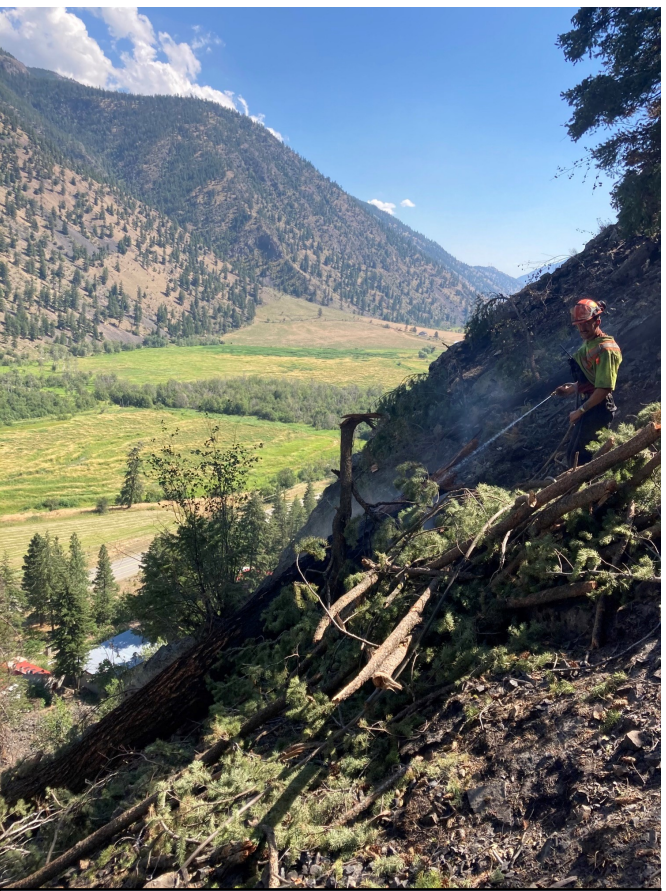
K50863—August 11, crews working on steep slopes along Hwy 3A to put out hot spots.

Last-Minute Checklist for Protecting Your Home and Property from Wildfire: